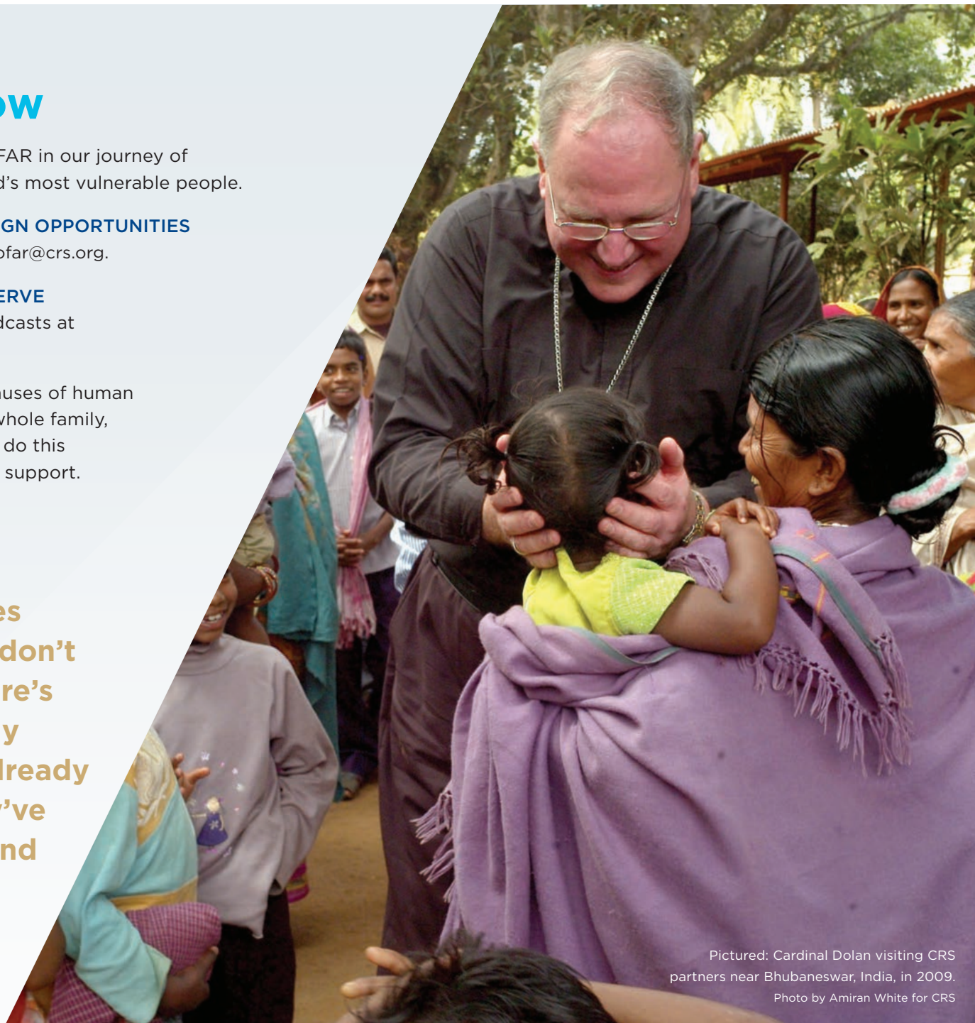
Pictured: Cardinal Dolan visiting CRS partners near Bhubaneswar, India, in 2009.